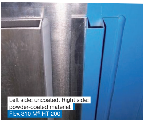
Left side: uncoated. Right side: powder-coated material. Flex 310 M® HT 200