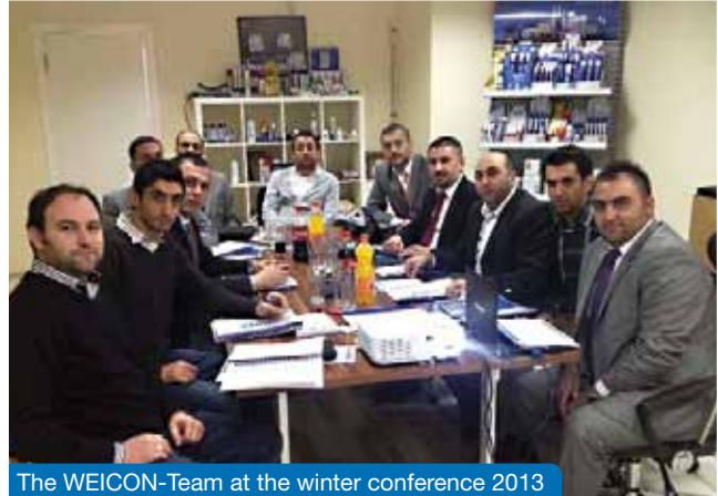
The WEICON-Team at the winter conference 2013

Just like in Germany, the Turkish WEICON branch also holds two conferences each year – one in summer and one in winter. During the conference, the Turkish sales representatives gained information about news at WEICON and the new products being brought onto the market this year.