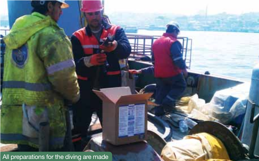
All preparations for the diving are made