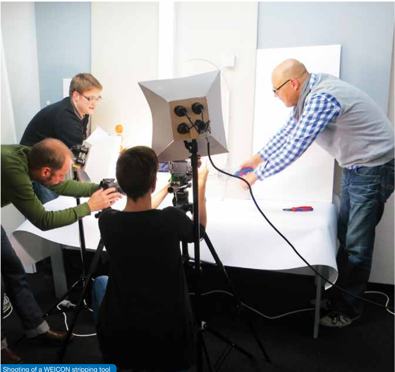
Shooting of a WEICON stripping tool

how to strip wires is shown in a simple way. These films will soon be available on our WEICON website. Further films from every product group will be added to the existing range at regular intervals.