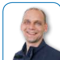
Marcel Oosterveen Shipping