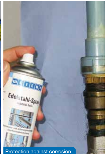
Protection against corrosion

The spray is suitable for cleaning a wide range of surfaces. For example, it can be used on metals, plastics, glass, ceramics or varnished and coated surfaces.