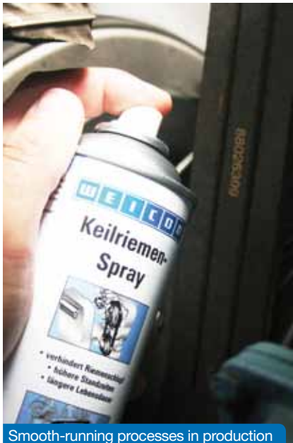
Smooth-running processes in production