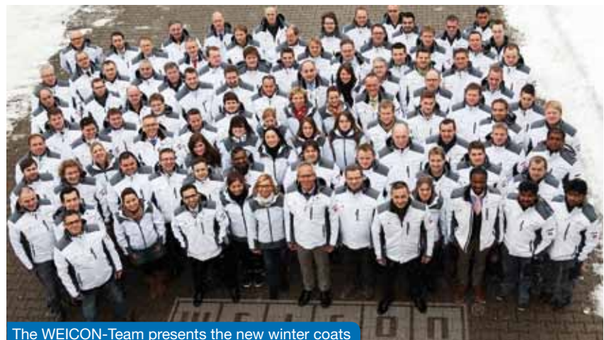
The WEICON-Team presents the new winter coats

successful business year 2012. It was great to see how pleased everyone was with the coats. Of course, the uniform appearance also promotes the team spirit within the company."