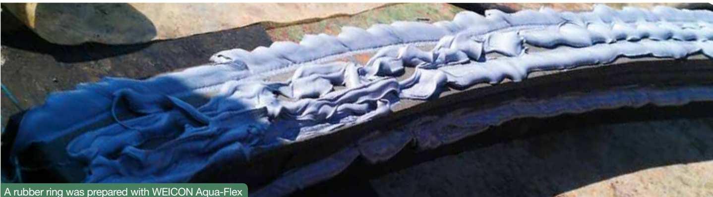
A rubber ring was prepared with WEICON Aqua-Flex