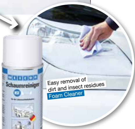
Easy removal of dirt and insect residues Foam Cleaner