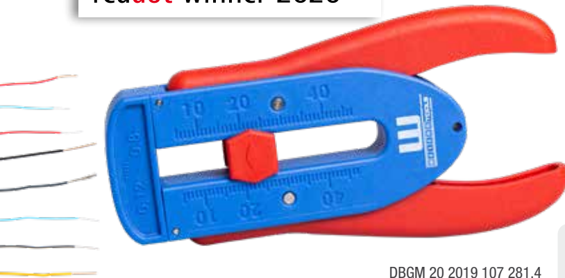
DBGM 20 2019 107 281.4