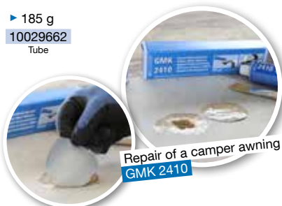
Repair of a camper awning GMK 2410

Contact adhesive for the bonding of rubber and metals .