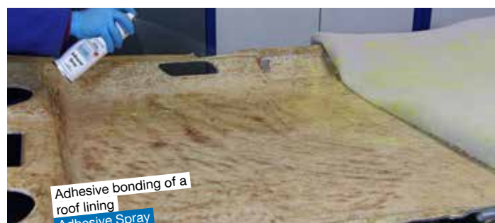
Adhesive bonding of a roof lining Adhesive Spray