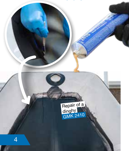
Repair of a dinghy GMK 2410

Contact adhesive for the bonding of rubber and metals .