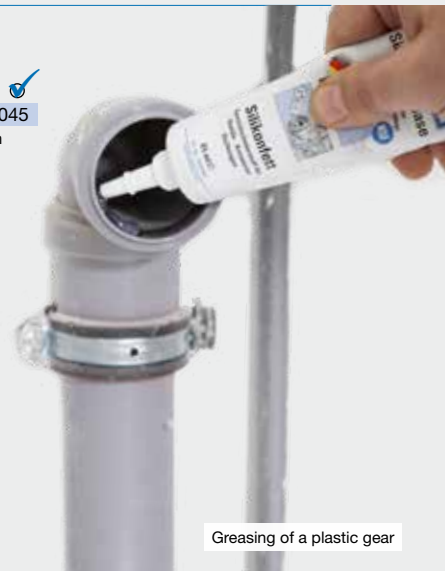
Greasing of a plastic gear

BAM tested and safety-tested according to - according to leaflet M 031-1 "List of nonmetallic materials supporting document to code of practice M 034e "Oxygen" (DGV Information 213-074)